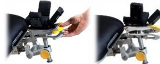
140-00270-08 Luigi headrest with pillows, for One grip headrest With multiple replaceable cushions in different thickness/firmness