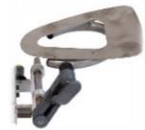
140-00252-05 Headrest FaceDown/FaceUp Tray that allows the patient to lie on the stomach or the back