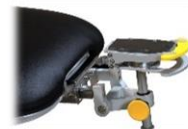
140-00270-07 Headrest One grip Tiltable headrest with seamless adjustment in angle, lateral tilt. With a quicklock to change between different headrests