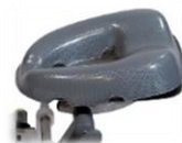
140-00270-06 Pillow for FaceDown/FaceUp Moulded, soft pillow both for facedown or faceup surgeries