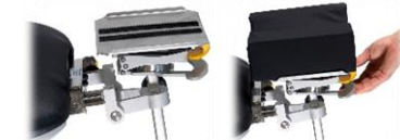
140-00270-09 S-tray, for onegrip Small tray for various pillows. The pillows are attached with velcro